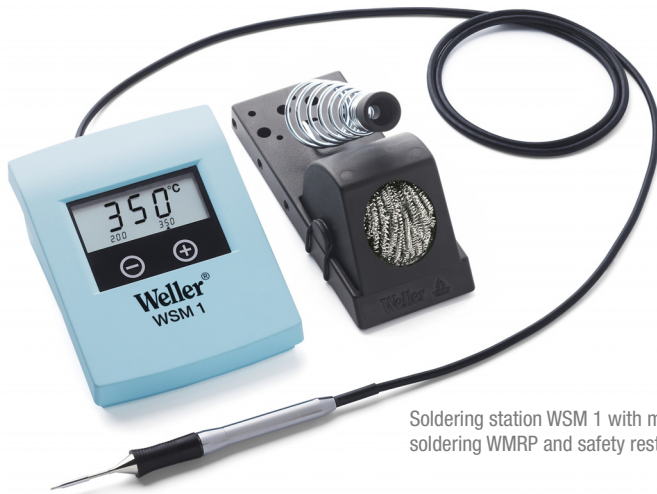
Soldering station WSM 1 with micro soldering WMRP and safety rest

ESD safe and designed for use in laboratories, repair, service and industrial engineering.